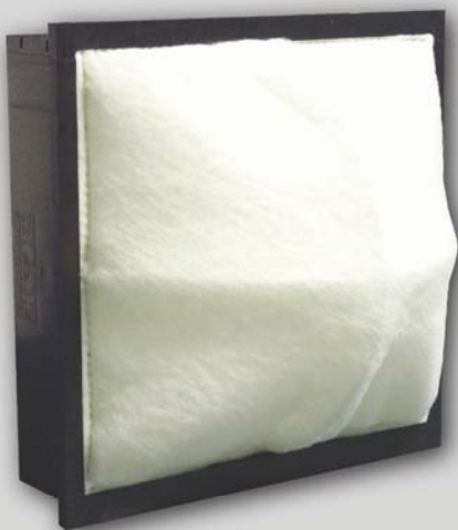
TRI-CELL XLR with Prefilter Cube