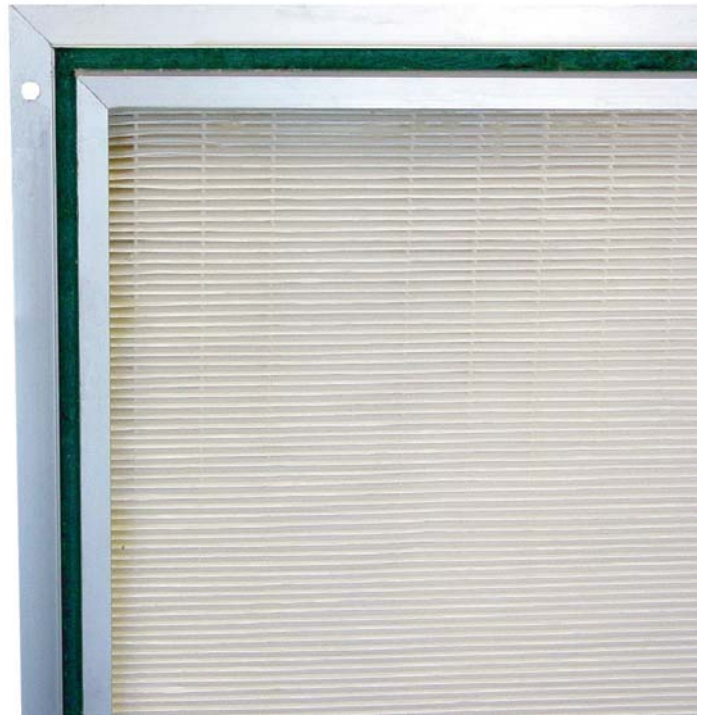
Tri-Pure Panel Filter showing the Reverse Perimeter Gel Seal Track and Flange used to mount in the module

In addition to the TRI-PURE GSR 2 Tri-Dim offers the TRI-PURE GSR Gel Seal Replaceable Hood – this is our premium module that offers a full range of features including an optional aerosol injection port.